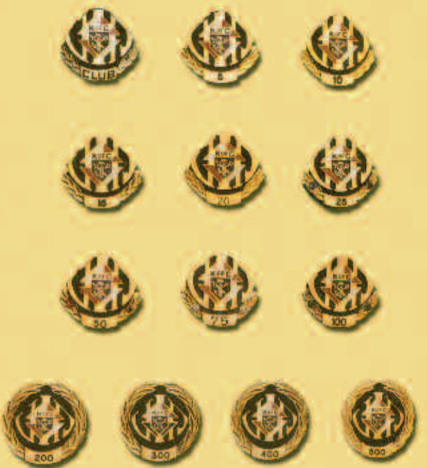
VIP Club lapel pins are distributed according to member levels achieved.