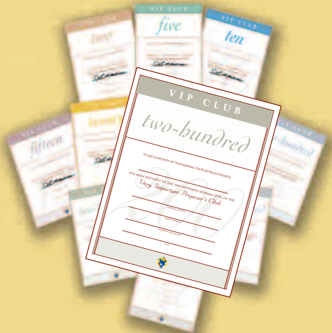
Members receive personalized VIP Club certificates at each level.