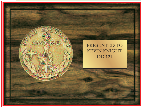
Star District Award